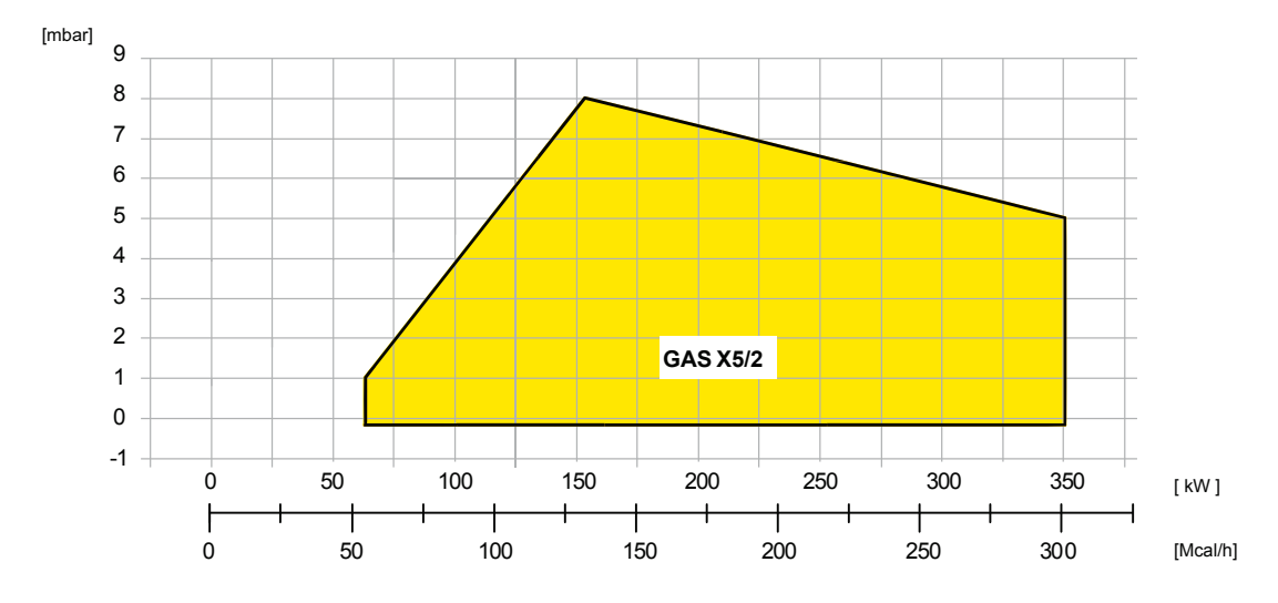
Fig. 2 X = Thermal power Y = Pression in the combustion chamber

The firing rates has been obtained based on test boilers in accordance with EN267 standards and are indicative of matching the burner to the boiler. For the correct operation of the burner, combustion chamber dimensions must be in accordance with current regulation. In case of non-compliance, contact the manufacturer.