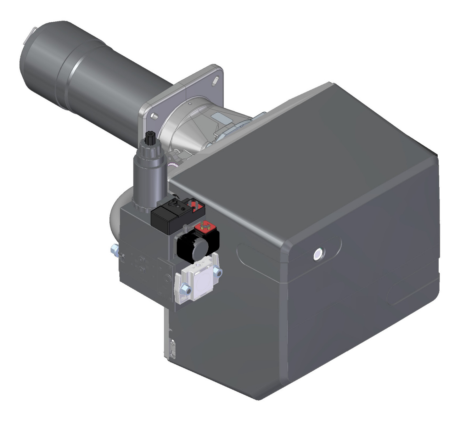
Fig. 1 GAS X5/2 CE-LX

Complete of connector plug / socket 7 poles, connector plug / socket 5 poles (for the 2nd stage modulation), flange and gasket for installation on generator.