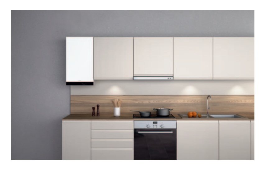
Vitodens 050-W with attractive design in Vitopearl white

With compact dimensions, low weight and quiet operation the Vitodens 050-W will integrate effortlessly into any living space.