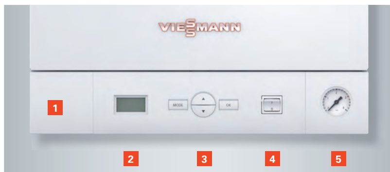
Control unit with integral diagnostic system