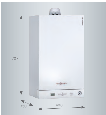
Low operating noise and compact dimensions make this boiler ideal for installation in living areas